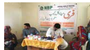
The Bank conducted a Free Medical Health Camp for the poor people of Thar. A team of Doctors and paramedical staff worked very hard in the remote area of Thar and provided treatment to women who are facing Gynaec problems. Similarly large a number of old-age people were also treated for eye ailments at Burkio Chachro, Tharparkar.