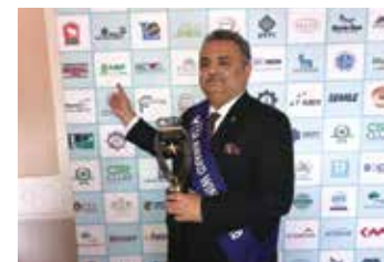
12th CSR Summit Awards 2020