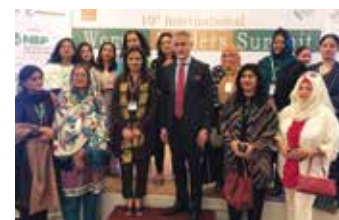
10th International Women Leaders' Summit

In collaboration with Kaus-e-Kazah Welfare Organization at District Tharparkar. Women of the area attended the skill training of Drafting, Cutting, Tailoring, Machine & Hand Embroidery, Knitting & Textile Designing. In the end, the Bank provided sewing machines to every participant so they can earn a livelihood for their families.