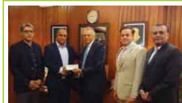
Donation to Namal College, Mianwali

To impart professional training, education and skills development for special persons, NBP provided 10 computers to the Pakistan Independent Living Centre.