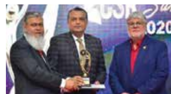
9th CSR Summit Awards 2020