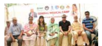
NBP, with the help of a local NGO, conducted a Free Medical Camp for women in the suburbs of Karachi. The women living in underprivileged areas are facing difficulties in getting Antenatal Gynaecology, Eye, ENT and Dental treatment. More than 250 women and children visited the camp and most of the women were treated for Gynaecology-related issues.