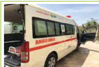
An Ambulance, equipped with portable oxygen equipment, cardiac monitor, paramedics & medicines, is donated to DHQ, Gawadar. Such ambulances are well-equipped to handle 80% lifesaving interventions & often handle critical cases.

Our key operations & areas of focus contribute to the UN Sustainable Development Goals